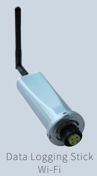
Data Logging Stick Wi-Fi