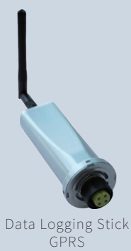
Data Logging Stick GPRS