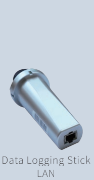
Data Logging Stick LAN