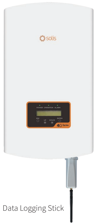
Data Logging Stick